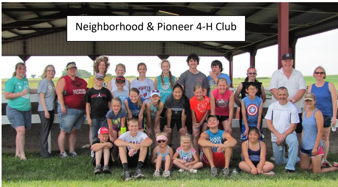
Neighborhood & Pioneer 4-H Club