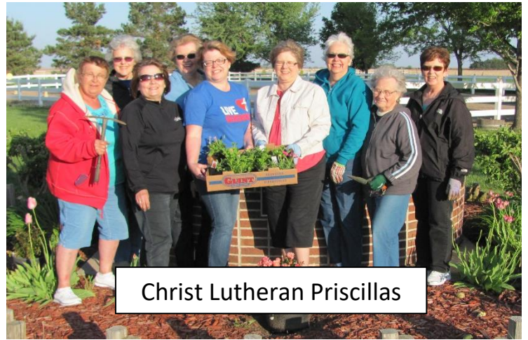
Christ Lutheran Priscillas