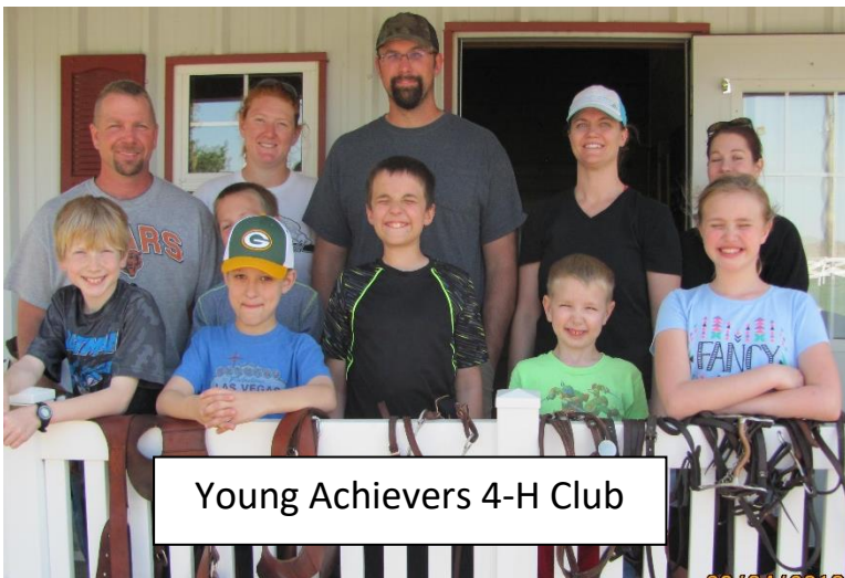
Young Achievers 4-H Club

Thank You to the many volunteers who keep S.M.I.L.E. looking its best for our riders for the past 25 years.