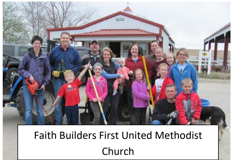
Faith Builders First United Methodist Church