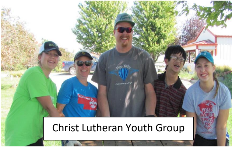
Christ Lutheran Youth Group