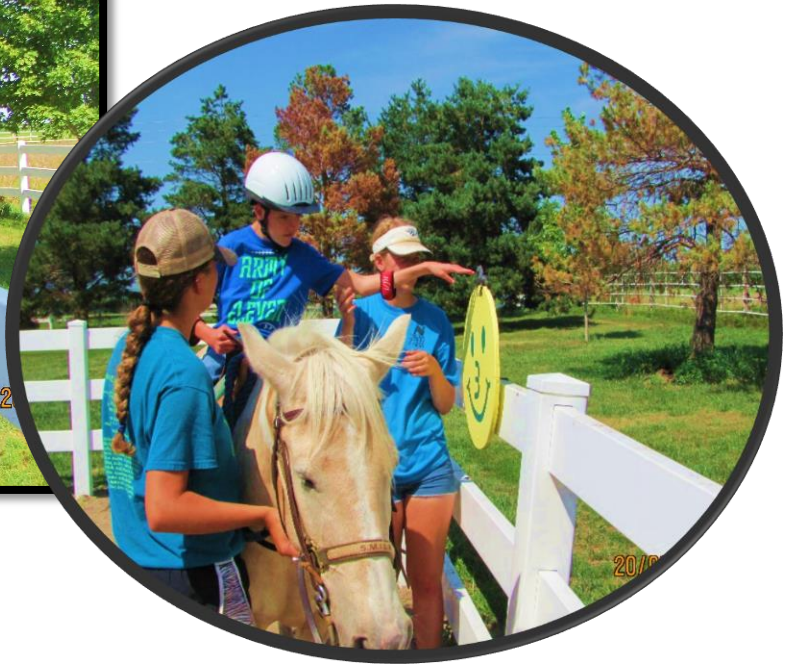
30 Norfolk Public Senior High, Junior High, & Elementary took lessons in 2016