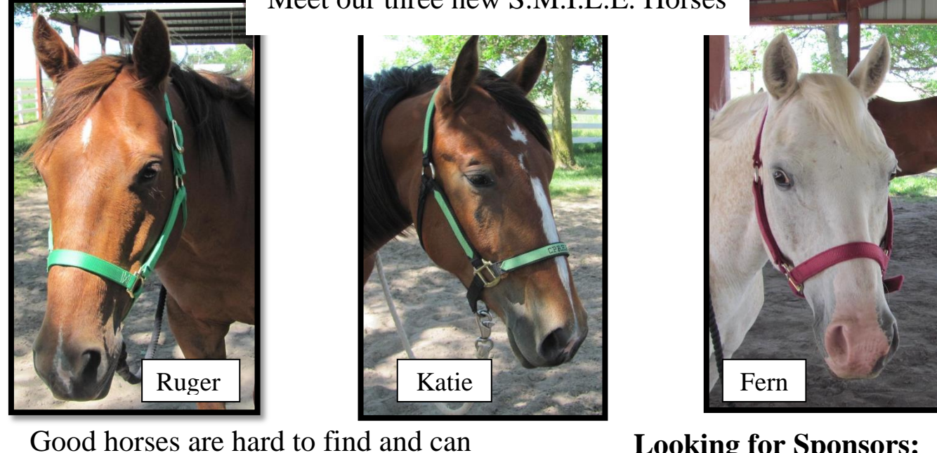
Looking for Sponsors: Horse: $2,500.00 Child: $640.00

Your donations and sponsorships make it possible for Everyone to ride on a