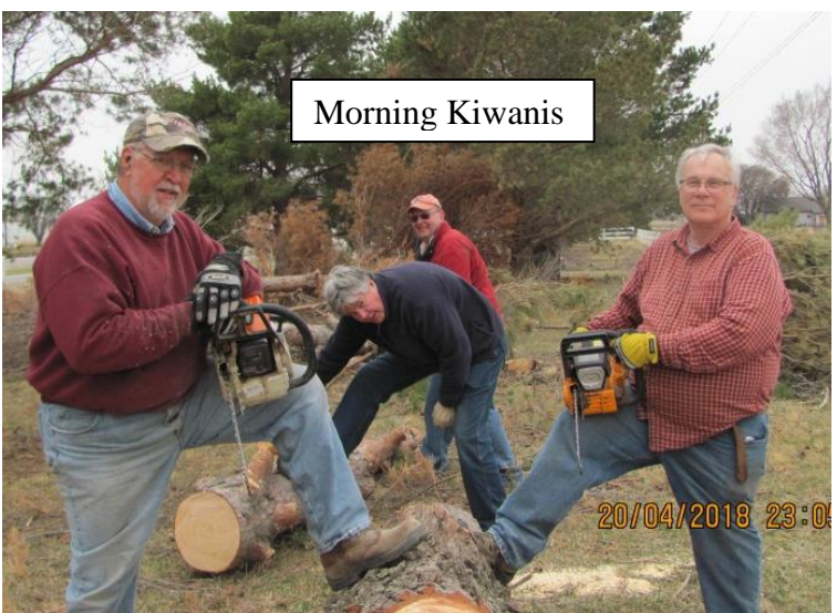
<u>Thank You</u> to the many volunteers, who keep S.M.I.L.E. looking its best for our riders